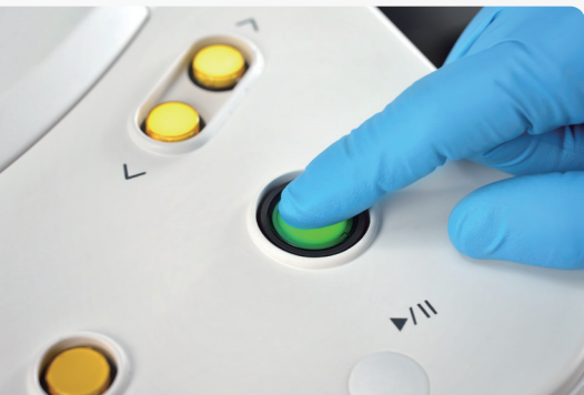
One-key start Extremely easy to use