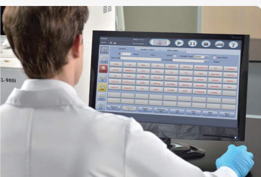
Intuitive software interface Easy access to all functions