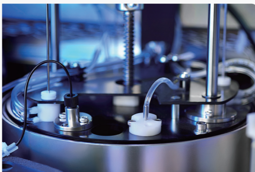
Precise magnetic separation with consistent performance reliability