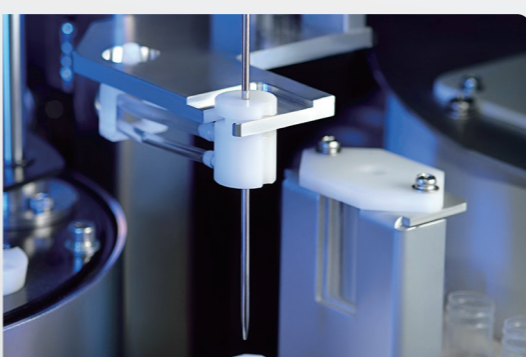
Wiper washing technology Enhance efficiency and minimize carryover