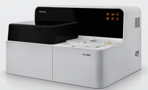
Intelligent consumables management