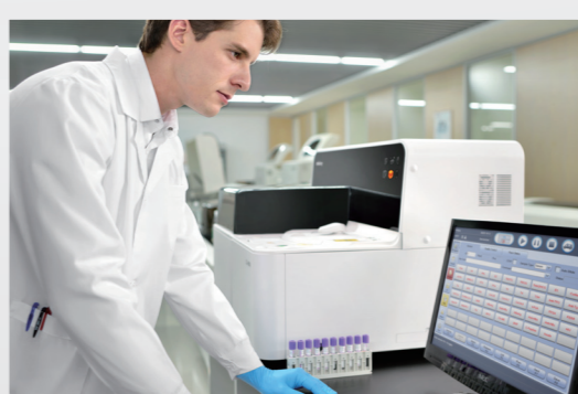
User maintenance free Lighten the workload