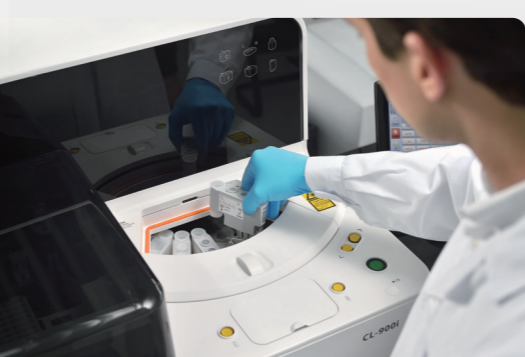
Continuously loading of reagents and consumables